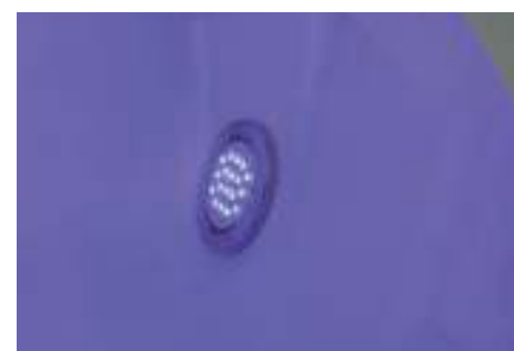
Faro cromoterapia Chromotherapy LED light