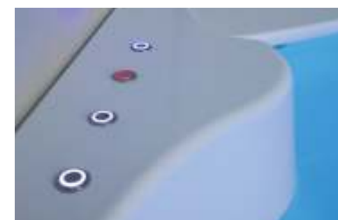
Pannello di controllo Control panel

Colonna di scarico con erogatore Overflow drain inclusive of fill spout