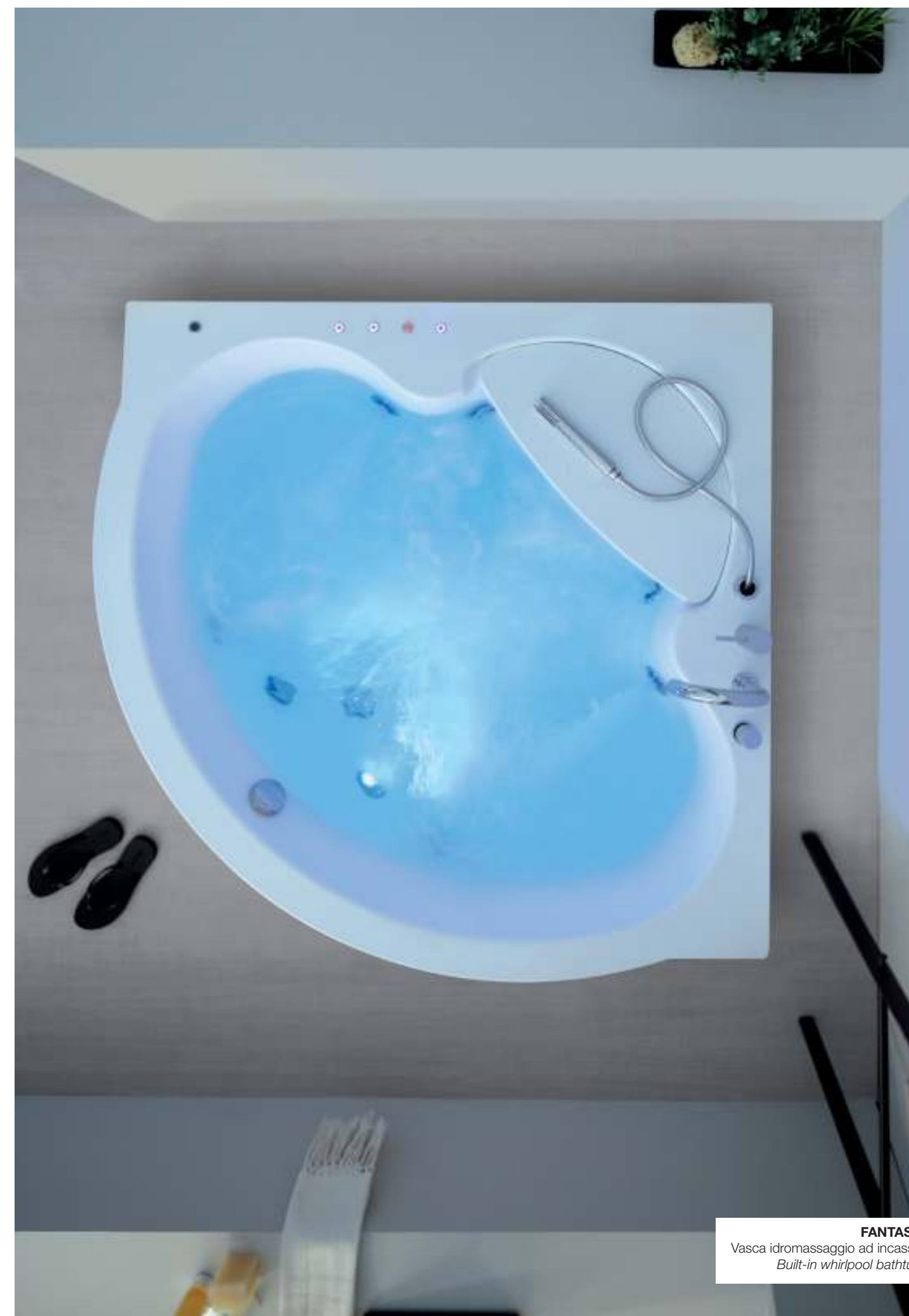
FANTASY Vasca idromassaggio ad incasso Built-in whirlpool bathtub